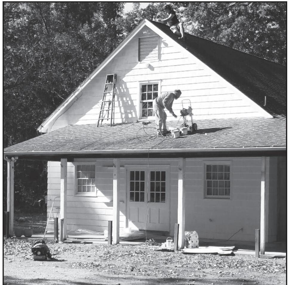
Workers giving Norfield Grange No. 146 in Weston a fresh coat of paint recently.