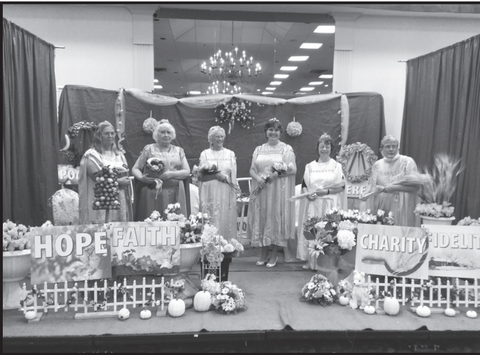
Flora's Court (reduced this year for COVID safety)