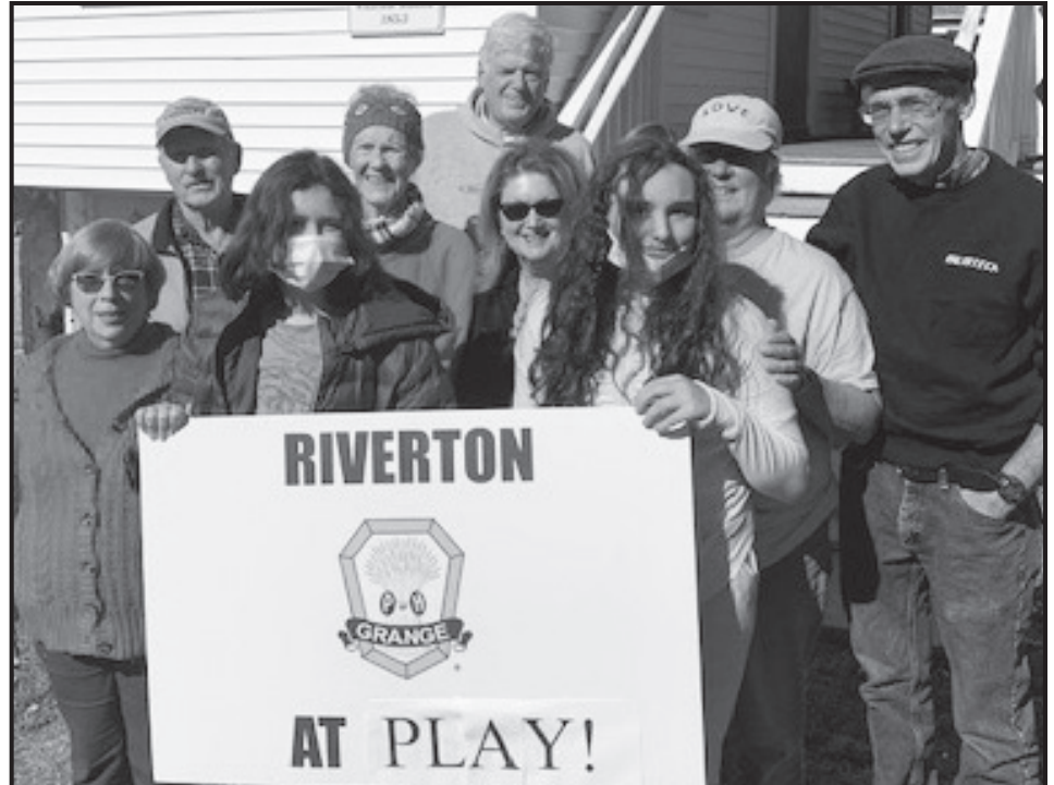
Members and friends of Riverton Grange No. 169 gather for a picture after their Mystery Tour of Squire's Tavern in Barkhamsted.

If refreshments are your favorite part of Grange meetings, you are in luck. Starting with the second meeting in October, we have